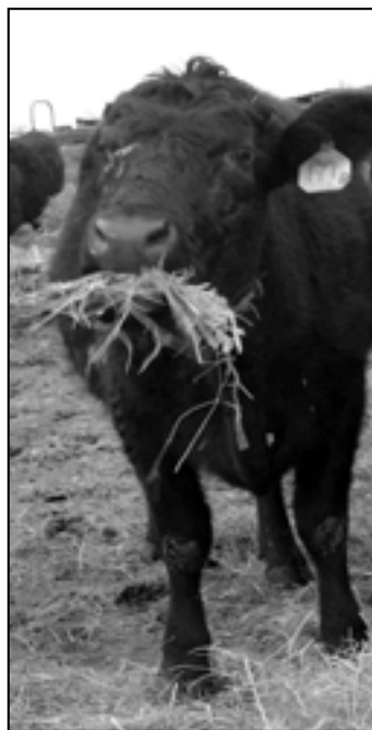
The fact that quality, quantity and availability dates can be preset in a swath-grazing program offers a major advantage to the beef producer.

When the cattle are on the swath-grazed oats, electric fence is used to restrict their feeding to specific areas.