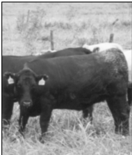
Bourbon County Cooperative Extension facilitates the program, does the paperwork and recordkeeping, and coordinates the screening and other aspects of the program.

In 1997 the program switched to only fall sales of pregnant heifers. Backed by an extensive health program, the heifers were guaranteed to be bred and were grouped for sale in uniform lots of four or five head.