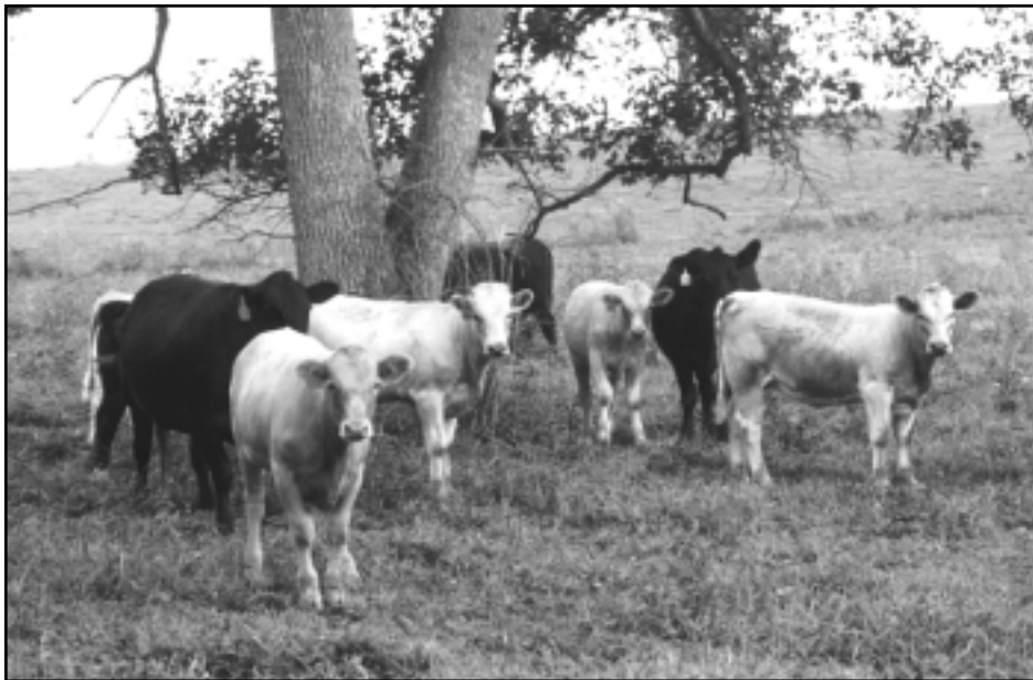
Preconditioned-calf sales in the area offer a means by which to sell heifers' progeny. The cows pictured here, now with their second calves, were Elite heifers in the 1999 sale.