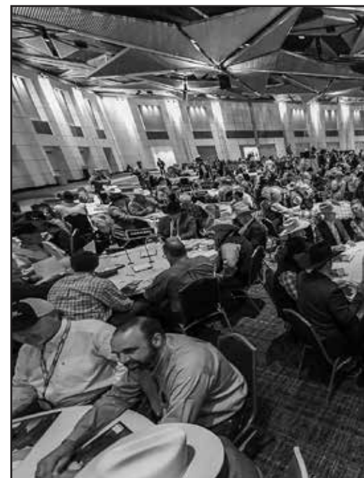
Members chosen to represent their states at the 134th Annual Convention of Delegates convened Monday, Nov. 6, to hear annual updates from Association staff and to elect new leadership for 2018. Delegates representing 40 states and the District of Columbia elected