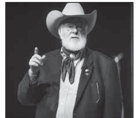
Red Steagall, native Texan, musician, poet and symbol of cowboy culture, provided an eloquent invocation reminding his audience to support and preserve rural communities.

The Association also introduced a new genomic profile, Angus GS™, which offers breeders an affordable tool to empower genomic selection. The Angus Genetics Inc. (AGI) team developed the tool specifically for Angus cattle and