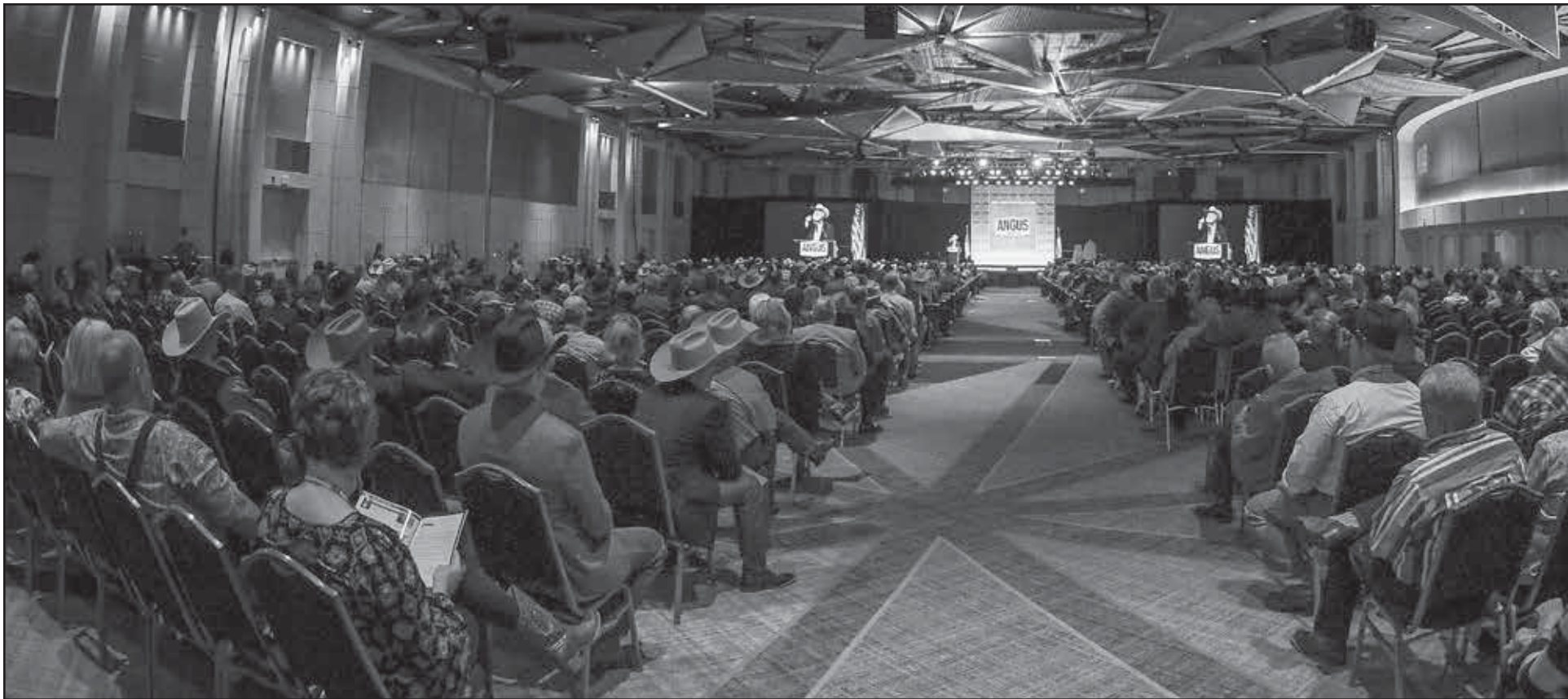
Nearly 2,500 Angus enthusiasts set an attendance record as they gathered in Fort Worth, Texas, for the 2017 Angus Convention and Trade Show.