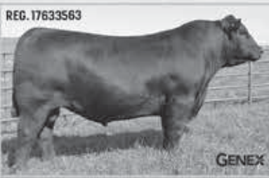
$ A V TEN SPEED 3022 - HIS SONS SELL! CED +4 BW +1.5 WW +67 YW +126 MILK +20 $W +55.51 $B +172.78