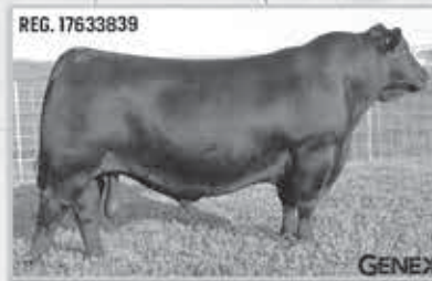
$ A V RENOWN 3439 - HIS SONS SELL! CED +1 BW +2.6 WW +73 YW +125 MILK +19 $W +61.67 $B +108.92