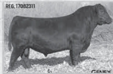
EF COMMANDO 1366 - HIS SONS SELL! CED +13 BW -8 WW +58 YW +96 MILK +29 $W +68.84 $B +119.47

OTHER FEATURED AI Sires INCLUDE: PVF INSIGHT 0129 | $ A V RESOURCE 1441 | ELLINGSON TOP SHELF 5050 VISION CASH 3414 | BSF HOT LOTTO 1401 | KOUPAL ADVANCE 28