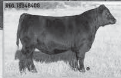
VISION CASH 7013 - HE SELLS! CED +8 BW +9 WW +59 YW +105 MILK +18 $W +51.08 $B +109.65