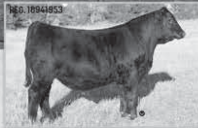
VISION INSIGHT 6104 - HE SELLS! CED +6 BW +1.5 WW +53 YW +98 MILK +21 $W +49.46 $B +124.03