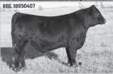
VISION TEN SPEED 7001 - HE SELLS! CED +13 BW -2.0 WW +63 YW +118 MILK +28 $W +66.42 $B +137.01