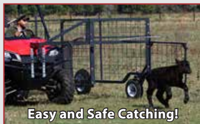
Easy and Safe Catching!