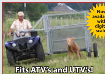
Fits ATV's and UTV's!