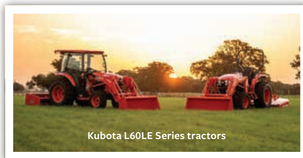
Kubota L60LE Series tractors

With features like Stall Guard and Auto Throttle Advance, the HST Plus transmission allows any operator, no matter the experience level, to feel and look like a professional. Other performance