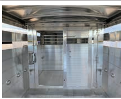
2000 Series aluminum truck bed