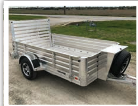
Endura livestock trailer

For more information, contact Hillsboro Industries at 800-835-0209 or visit https://www.hillsboroindustries.com/ .