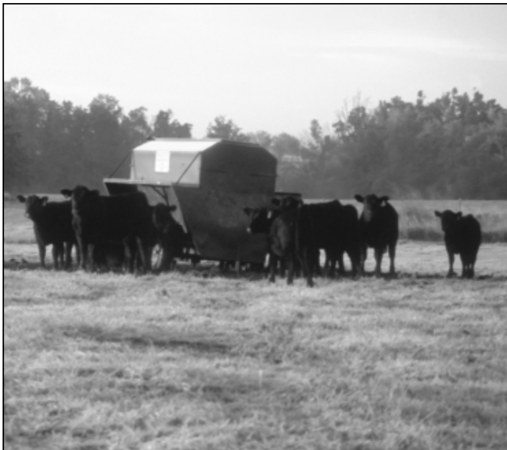
Especially to the growing number of producers who have another job during the day, the convenience and labor savings of self-limited products are an advantage. Often, a self-feeder may need to be filled only once per week, and a service-oriented dealer may do that, allowing producers to use the time they have with the cattle for observation.