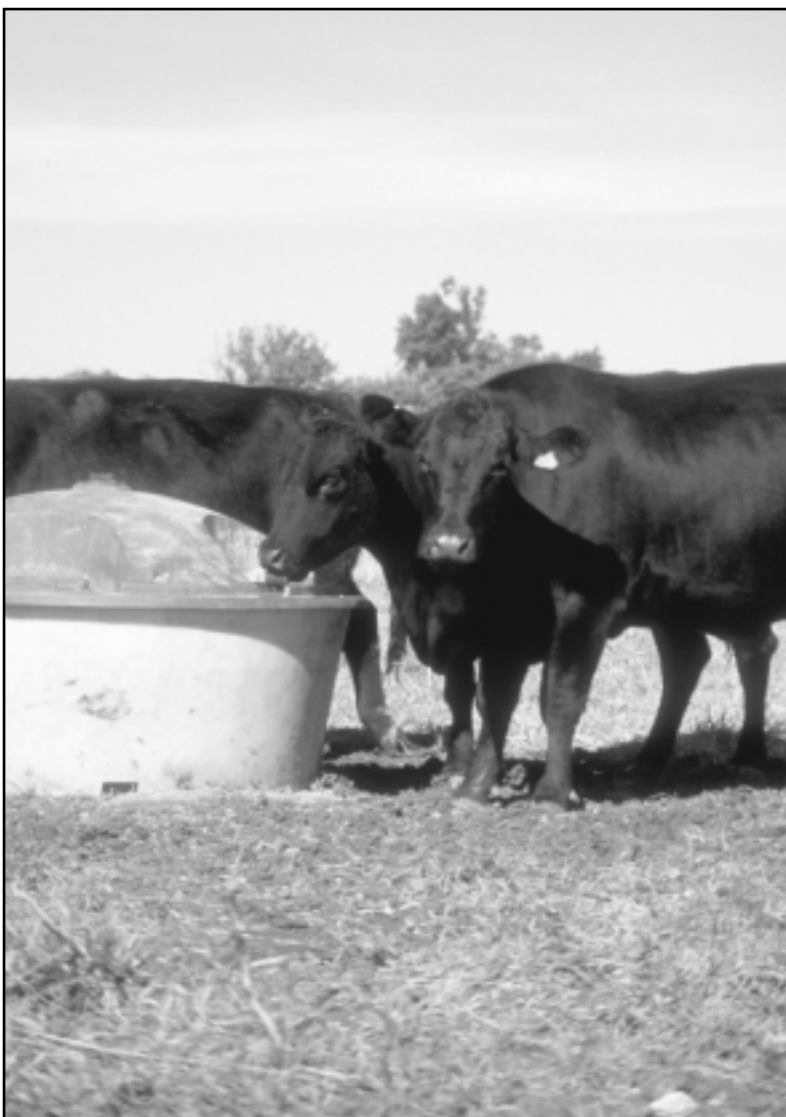
This system foils the “boss cows” that always seem to get more than their share of hand-fed supplements. Even the timid cows have equal access to the supplement every day.