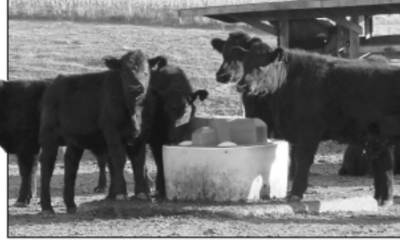
Livestock auction services, such as the United Producers' Paris Stockyards, Paris, Ky., are helping producers get information after the sale. After calves are sold through Paris Stockyards' certified preconditioned calf sales, the University of Kentucky Extension Service helps retrieve feeding and carcass data for producers.

One option for producers is to put the request for data right up front, making it a condition of the sale, says