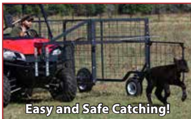
Easy and Safe Catching!