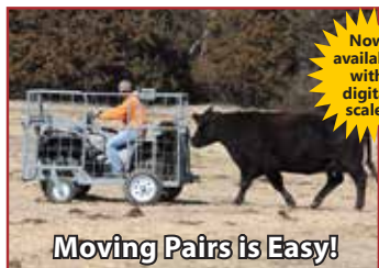
Moving Pairs is Easy!