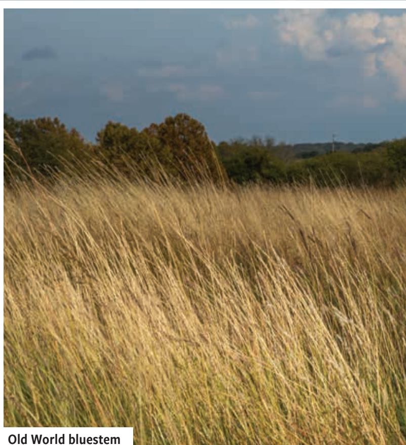
Old World bluestem