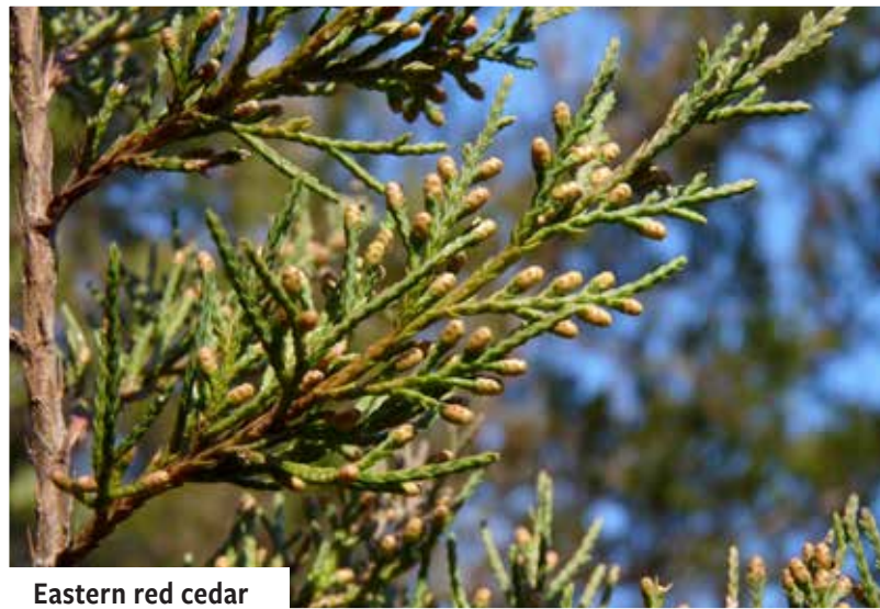
Eastern red cedar

She calls Ashe (blueberry) juniper a "more tame" species. It does not have the same bud reserves, and it will not resprout if the top is cut off. Yet Ashe junipers also form dense thickets that