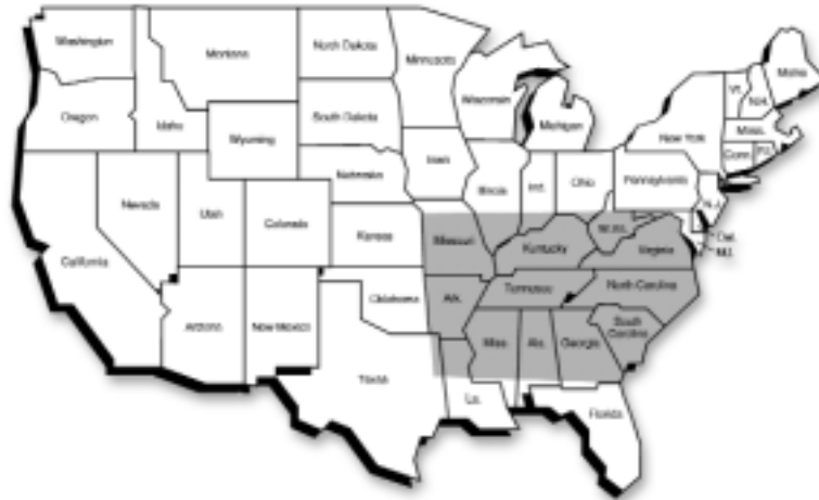
Map: The American "Fescue Belt"

the pasture is kept at a pH of 5.5 to 6.5, phosphorous and potassium are added, and the fescue is kept short so as not to shade the clover.