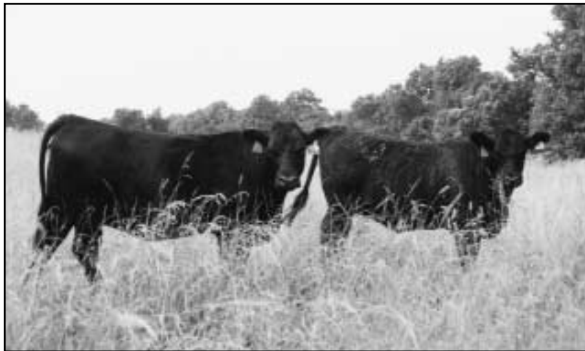
Retaining the winter hair coat into the summer is a good indicator that cattle are being affected by alkaloid toxicosis in infected tall-fescue pastures. Within any herd, some individuals may exhibit signs of the toxicosis while others do not.

Robertson agrees, "You need to be aware of the differences and observe them in breeding stock. Ask questions about the fescue adaptability of those cattle."