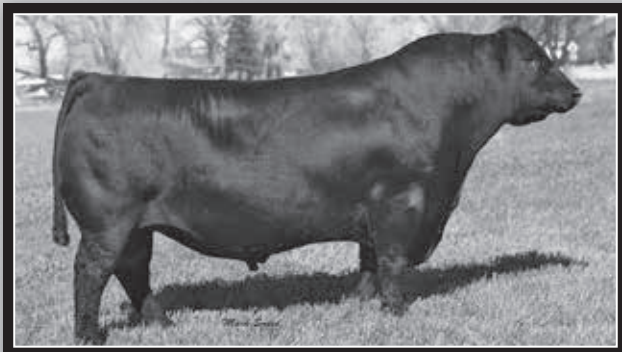
Schiefelbein Effective Our number one overall satisfaction sire