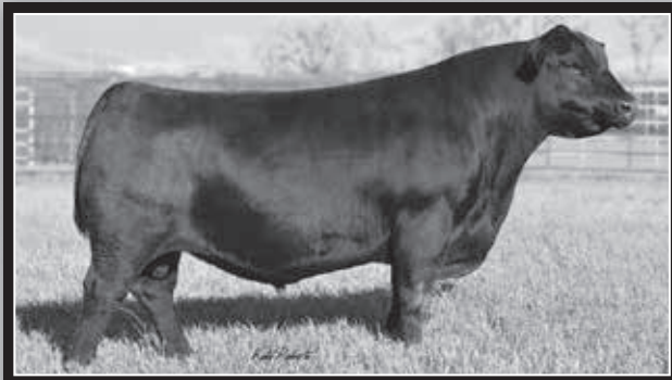
Schiefelbein Allied Semen available through Genex