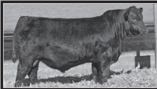
Schiefelbein iBull semen available through Genex