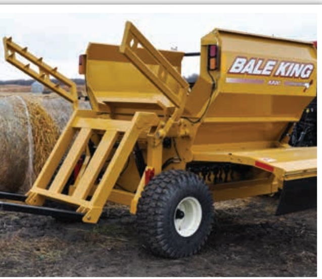
Just announced, Bridgeview Mfg. will offer a grand prize giveaway valued at $30,000 — the Bale King 5300 three-bale processor. Find product details at http://bit.ly/NAC-5300 .

The exciting Innovation Workshop series from Neogen will be featured in the trade show again this year, as will John Deere, Priefert/Tru-Test and Bale King grand prize giveaways. CAB-brand meals will be featured throughout the weekend.