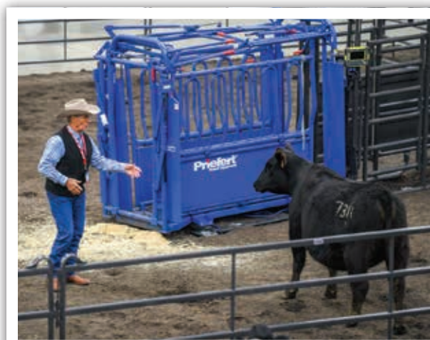
Education is at the heart of each Angus Convention. The multitude of workshops hosted by Association staff and allied industry representatives will provide real-world scenarios to equip attendees with practical information to take back home to the ranch.