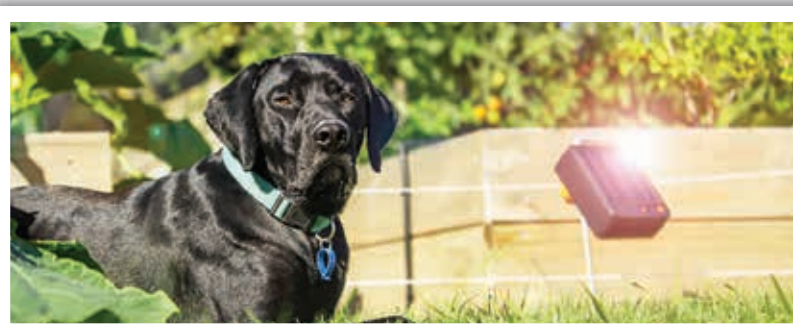
Gallagher S6 Lithium Energizer

The energizers are long-lasting, self-sufficient, highly portable, and easy to install and maintain. To learn more visit http://bit.ly/ABBxGal .