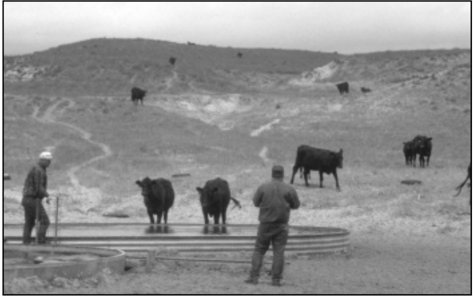
Maassen Brothers Ranch is home to more than 1,000 Angus cows, mostly commercial, that run on some 15,000 acres of Sandhills grass.