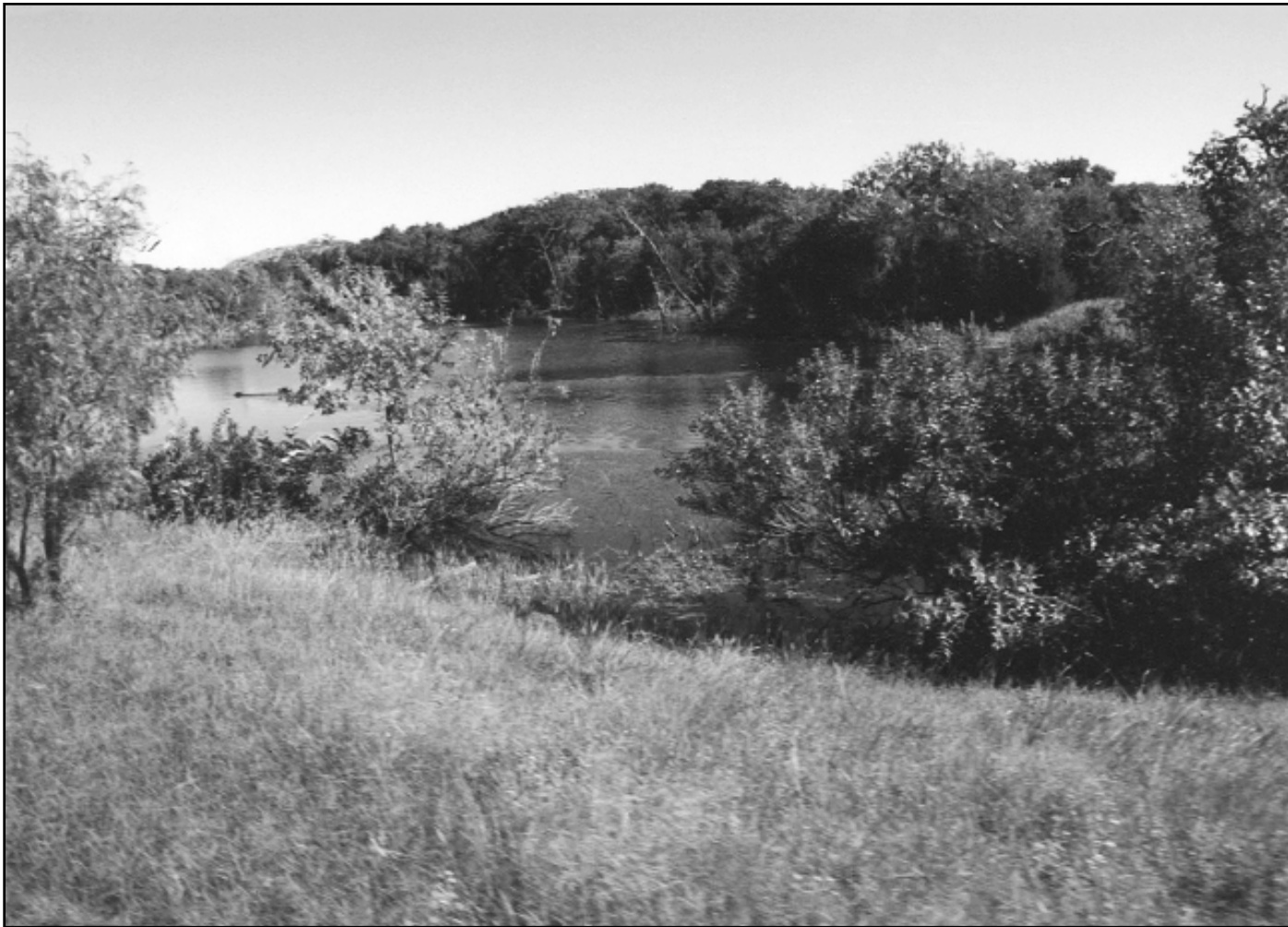
The Phelans' carefully controlled grazing system has resulted in healthy wetlands, an abundance of wildlife and increased grazing capacity.