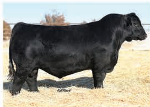
KR STORM REG: 19526337