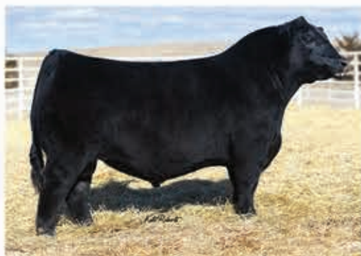
KR QUALITY REG: 19219149