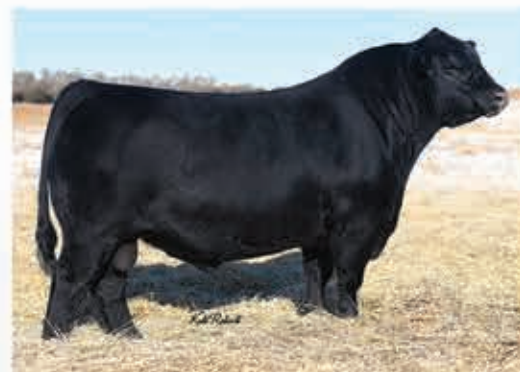
KR SYNERGY REG: 18875709