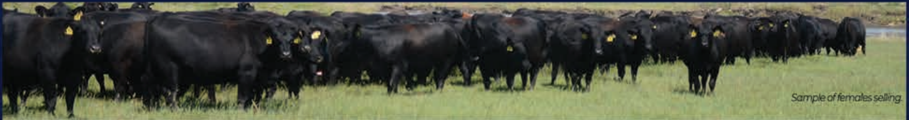
Sample of females selling.