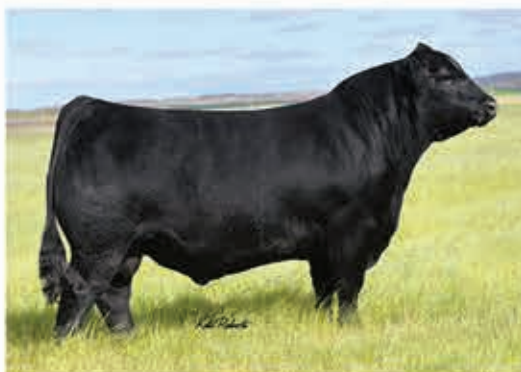
KR Mojo REG: 19219146