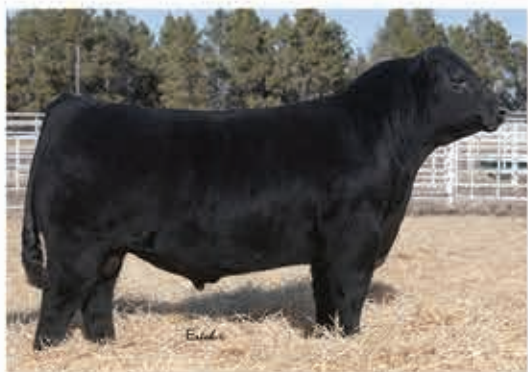
CAR DON ANNUITY 114 REG: 19720973