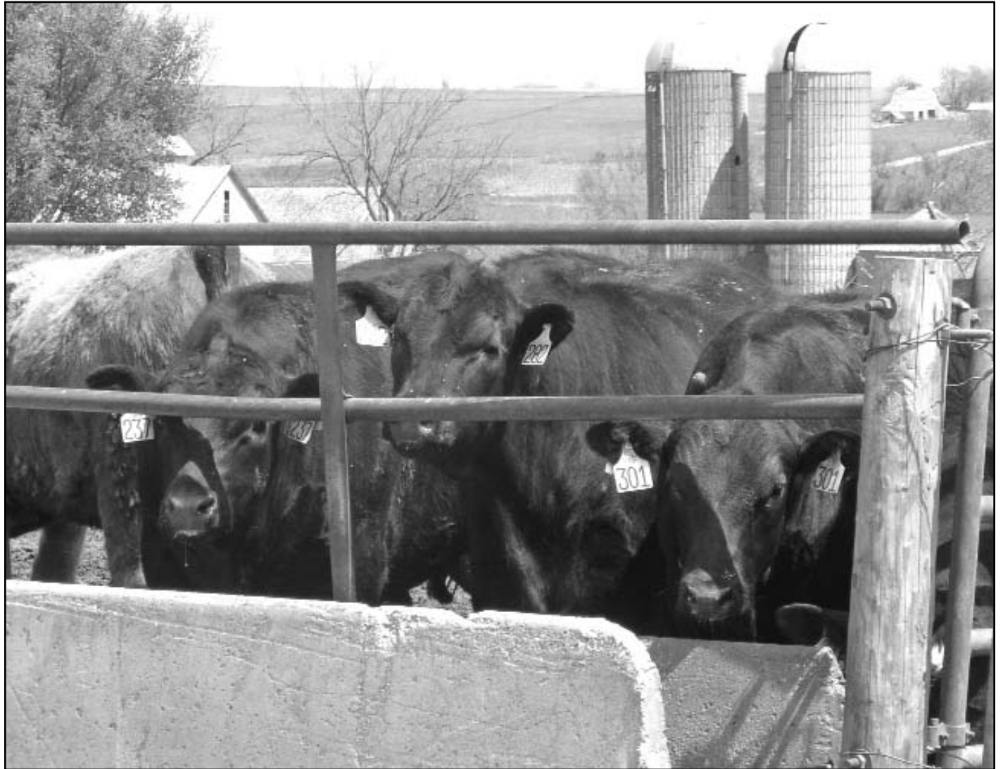
Management personnel at Iowa's Silver Creek Feeders Inc. were able to increase quality grades while reducing the number of YG 4s and 5s. The yard's 2002 record was 24.2% CAB/Prime with 12% YG 4s and 1.8% 5s. In 2003, 36.3% of the Silver Creek enrollments attained CAB or Prime, while YG 4s went to 8.5% and YG 5s almost disappeared at 0.4%.

The top three feedlots achieving that combination in 2004