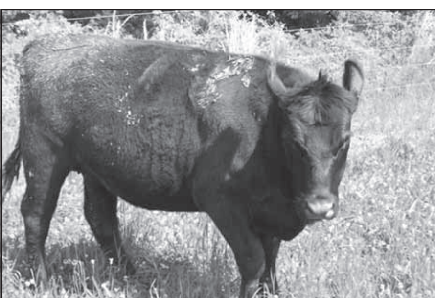
Hair-coat score 5