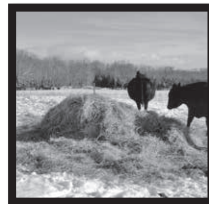
Above: Cattle at Angus Glen Farms are shown after one day of bale grazing round bales.

Plenty of adjustments can be made for bale grazing in less-than-optimal conditions, Chedzoy says. If soil