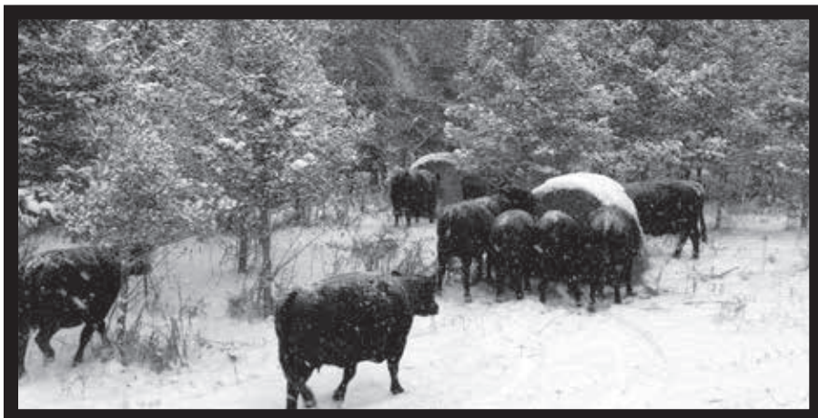
Angus Glen cattle in upstate New York take shelter in mixed conifer plantations called “living barns.” Round bales are stored between trees, so cattle can continue eating during storms.

Feeding on sites that don’t have a living plant root growing in them to capture nutrients creates a nutrient sinkhole, says Lindquist. “Bale grazing on sod really works well, because even in the dead of winter, those sod roots are active below the soil surface.”