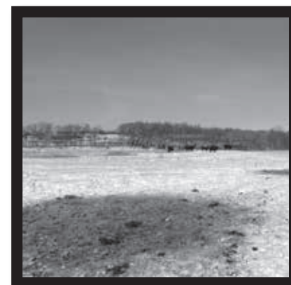
Below: This picture shows hay wastage after two days of bale grazing.