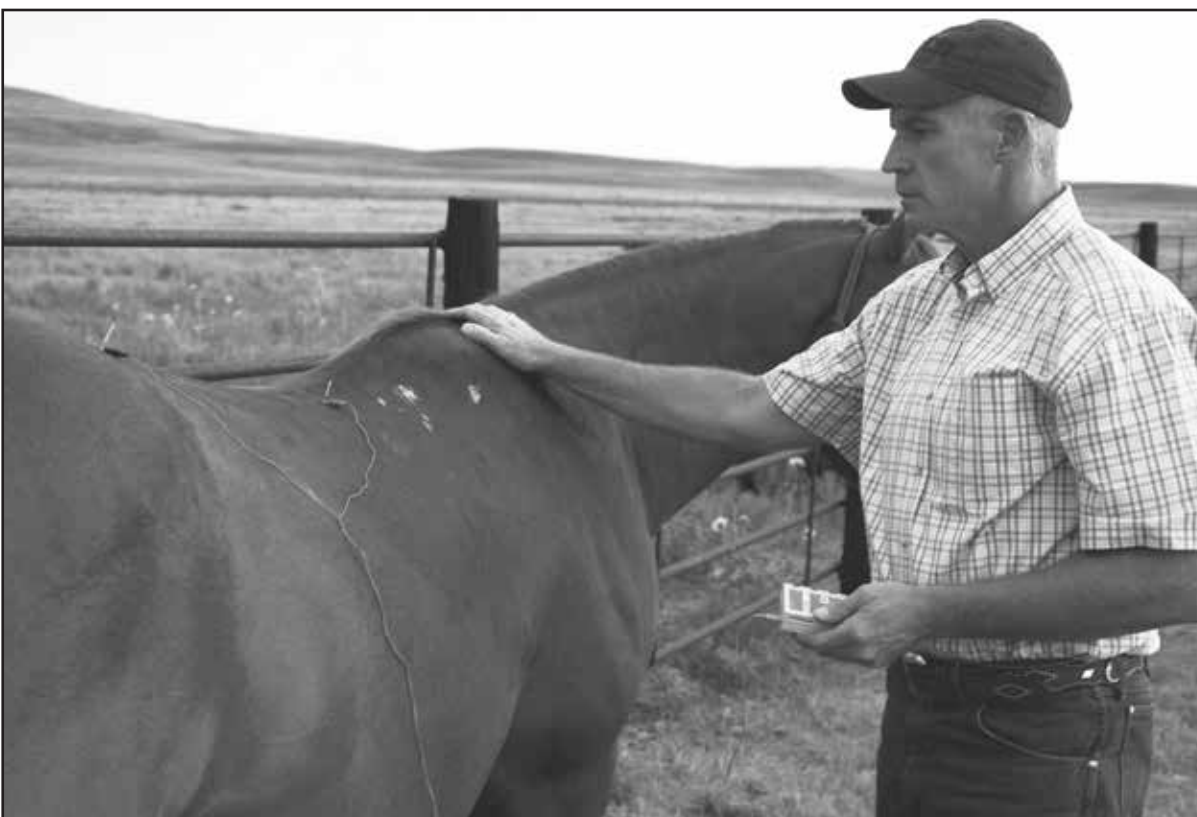
Schnell stimulates nerves by applying a series of small electric pulses to specific acupuncture points.

Animal chiropractic and acupuncture are earning respect of veterinarians and livestock owners as supplemental therapy and sometimes cure for maladies ranging from indigestion to performance injuries.