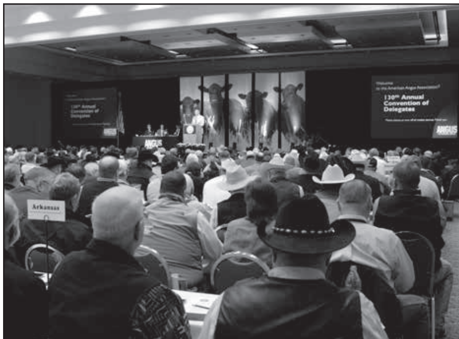
The event will see the continuation of the business meetings of the Association and the Angus Auxiliary — a candidate's forum, the election of board members, and reports from staff and officers.

This is where it all began — and it's altogether fitting that Angus return to Kansas City, to celebrate its heritage, to set the course for the future.