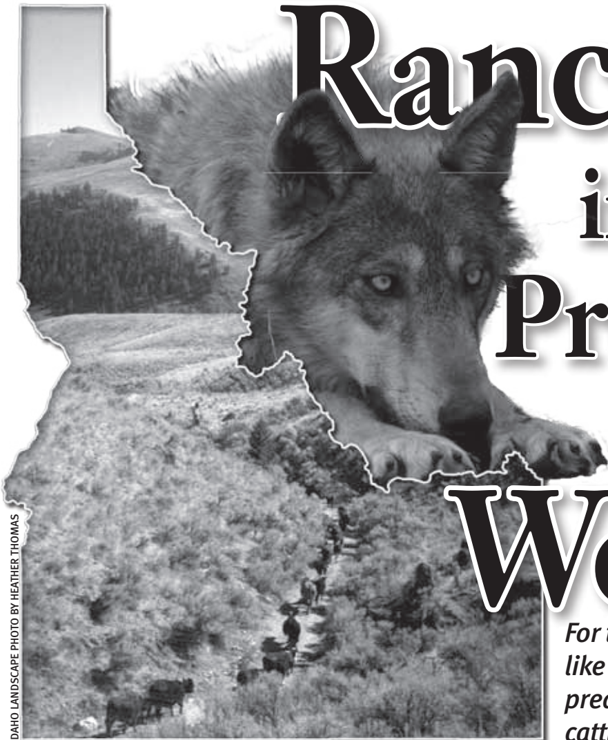
IDAHO LANDSCAPE