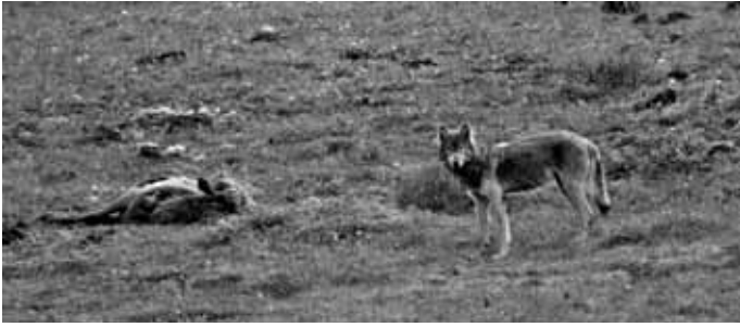
A gray wolf stands near an elk kill on Idaho's OX Ranch, located about two-plus hours due north of Boise.