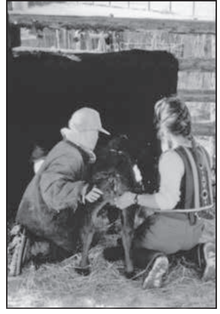
Restraining a cow to allow a calf to suckle can help initiate the bonding process.

sessions or even for days or weeks before they accept the calf. What might work for one might not work for another. It usually helps to keep the pair in a small pen and to have the cow or heifer hobbled so she can't kick the calf. If she is aggressive toward the calf, they'll have to be in separate adjacent