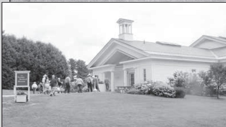
Left: Participants were able to view many of Norman Rockwell's original paintings and his studio at the Norman Rockwell Museum in Stockbridge, Mass.