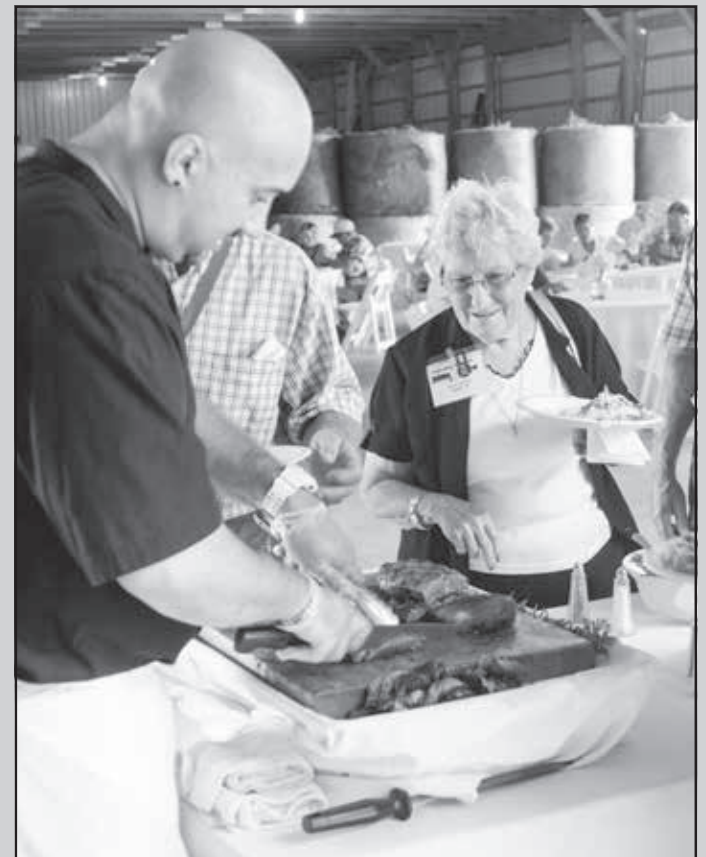
Right: Attendees enjoy a gourmet meal at Walbridge Farm and Market.