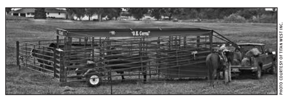
Hauled to the cattle on a panel carrier, commercial portable corral systems of various sizes are available and can be set up in a matter of minutes.