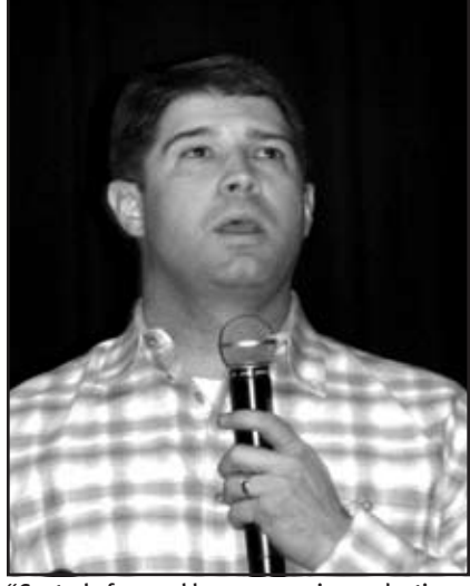
"Control of annual bromes requires reduction of the seed bank over time," ARS Range Ecologist Lance Vermeire said. "If we don't manage the seed bank, it will snap back quickly."

Vermeire explained that these herbicides have been shown to cause seed sterility in cereal crops if applied during seed development. And, similarly, the researchers found that dicamba and picloram both gave reductions in viable seed when applied to brome plants. The 2.4-D had no effect.