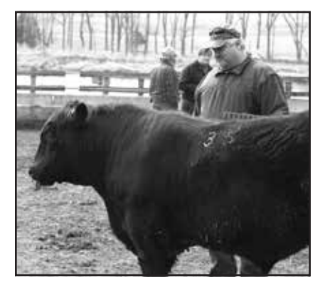
The program's success is evident by its many repeat consignors and buyers.

"Our goal is to keep our evaluation program meeting and exceeding BIF (Beef Improvement Federation) regulations," he explains.