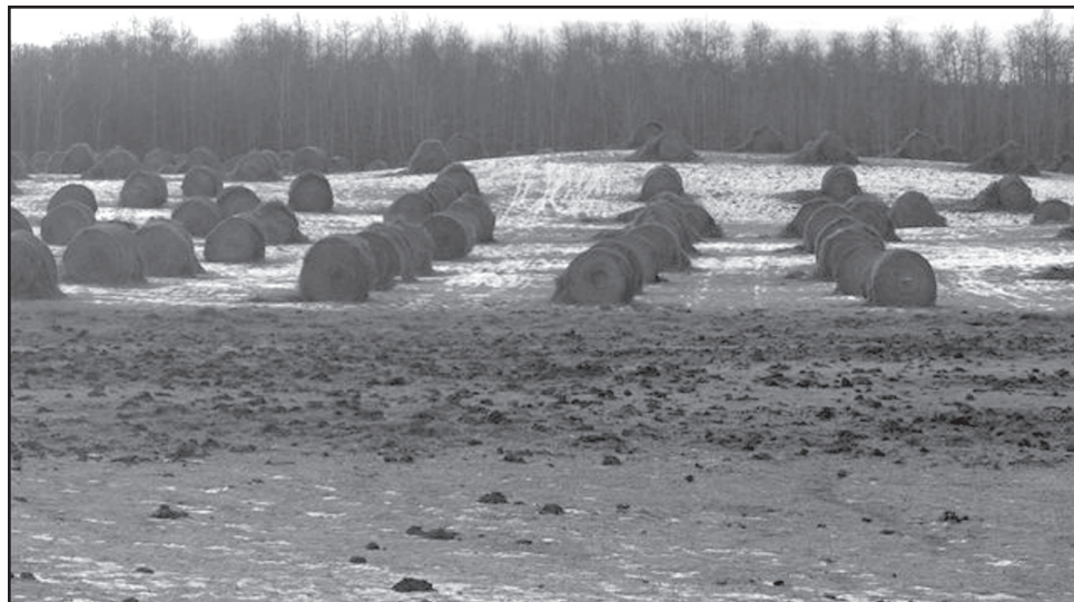
Bale-grazing distributes manure over the field for grass to utilize in the coming year.