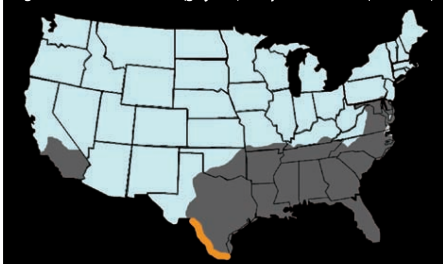
Fig. 2: Cattle fever tick habitat (grey area) and quarantine zones (brown area)

“As long as wildlife continue serving as hosts, reintroduction is a constant threat,” Ellis says. “Cattlemen in both the U.S. and Mexico want to work with us to solve this fever tick problem, but the deer people have not been as helpful because there’s no incentive for them; they risk losing their hunting revenue. Meanwhile, the entire U.S. cattle industry is at risk if Cattle Tick Fever returns to the United States.”