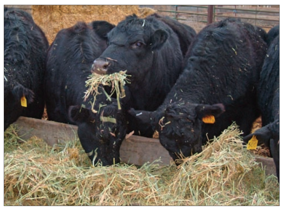
► "The forage test not only tells you what you need to feed your livestock, but it is also a good benchmark for determining how well you have done with your forage production," notes Jane Parish.

"The chain is only as strong as its weakest link," Nelson says. "So if you have a deficiency, it is going to show up in something that is counterproductive relative to performance and profitability."